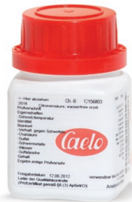
SUPPLYING RAW MATERIALS